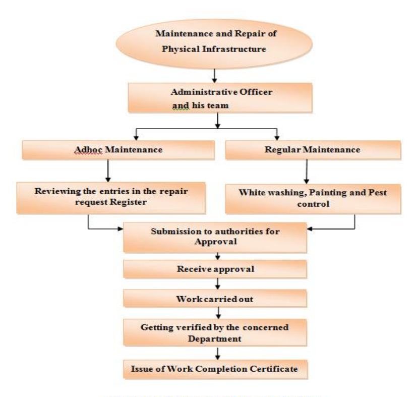
Fig. No. 1: Maintenance of Physical Facilities

event is registered and the halls are accessed on priority basis.